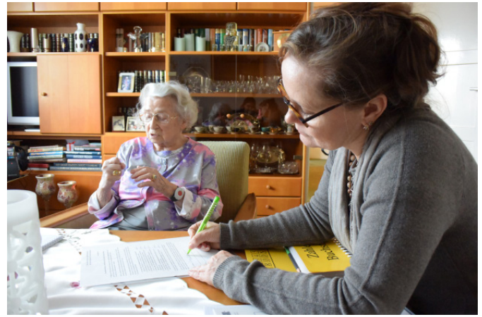
Figure 3. Mrs. A. answering Kirsten Becker’s questions in her living room. The test materials for the Digit Letter task (see below) can be seen on the table as well (yellow flip book).

Sandra Düzel (SD): As a scientist, I am not only absorbed by the data that our participants con-