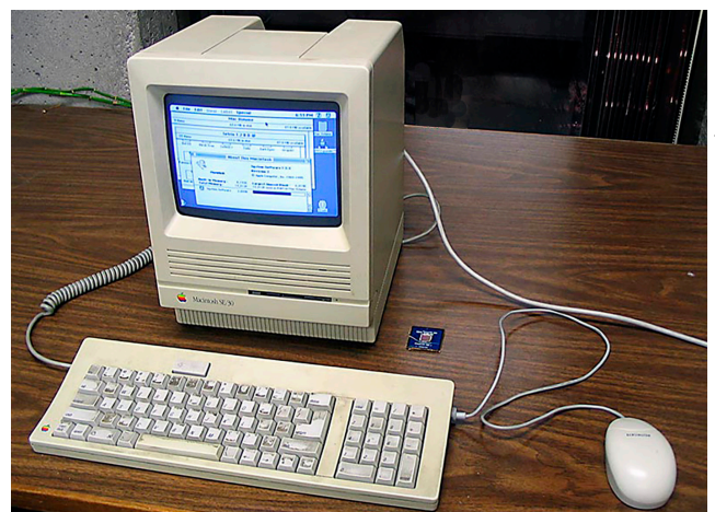
Macintosh SE/30 like the ones used in BASE T1–T8.