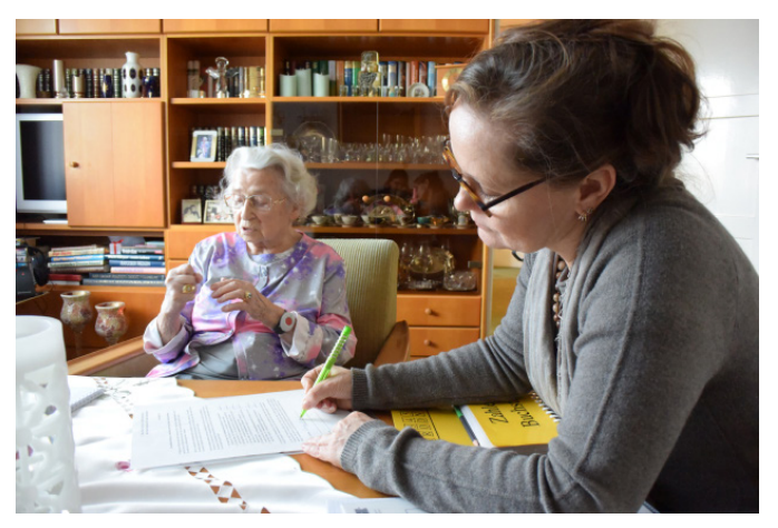
Figure 3. Mrs. A. answering Kirsten Becker's questions in her living room. The test materials for the Digit Letter task (see below) can be seen on the table as well (yellow flip book).

Sandra Düzel (SD): As a scientist, I am not only absorbed by the data that our participants con-